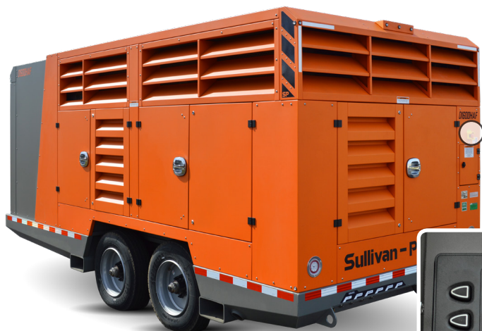
Sullivan-Palatek Electronic Controller (SPEC)